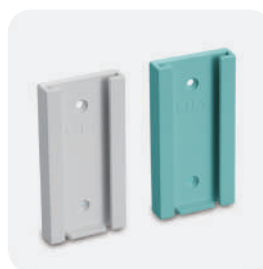
CSB-A04 Wall Mount, Green or White