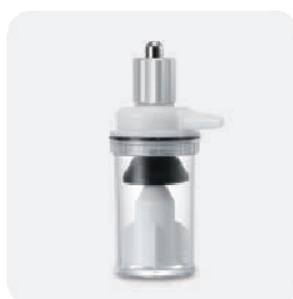
CSB-A03 Shut Off Valve