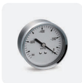
CSB-A02 Suction Gauge, 0~700mmHg