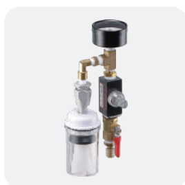
CSB-A01 Regulator Module